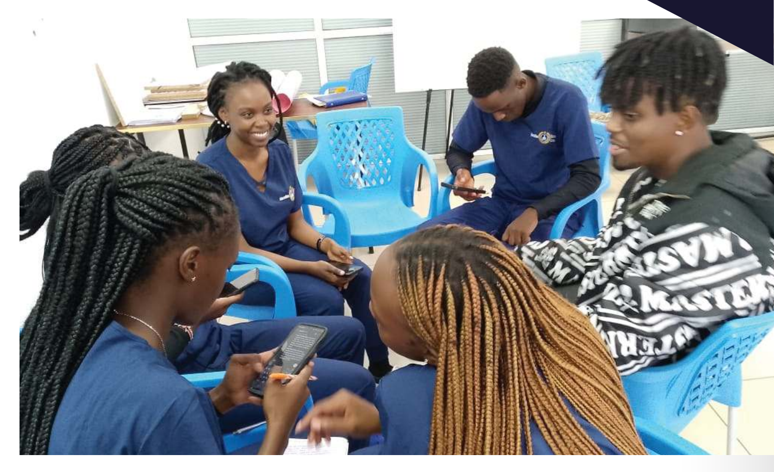
OUR TRAINEES IN THEIR DISCUSSION GROUPS: FOSTERING TEAM WORK AND COLLABORATION